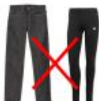
Jeans, skinny jeans, jeggings, leggings or chino style