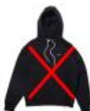
Non-uniform hoodies or jumpers