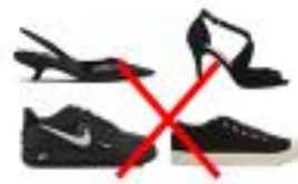
'Peep toes', 'sling back' or shoes with non-black logos or soles